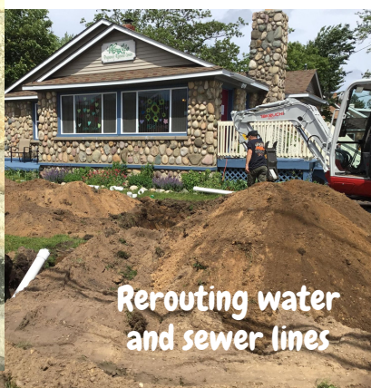
Rerouting water and sewer lines