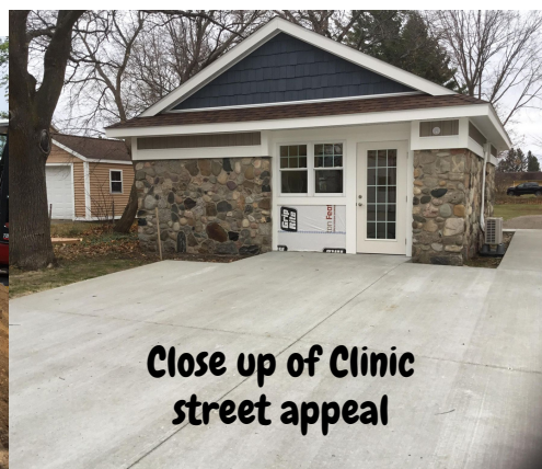
Close up of Clinic street appeal