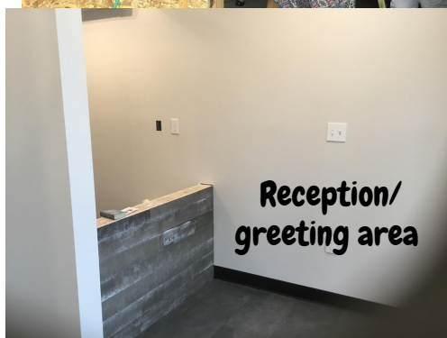
Reception/ greeting area