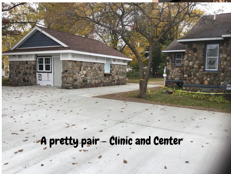
A pretty pair – Clinic and Center

OUR GOAL: $465,000 FOR CONSTRUCTION AND 3 YEARS OPERATING EXPENSES . . .